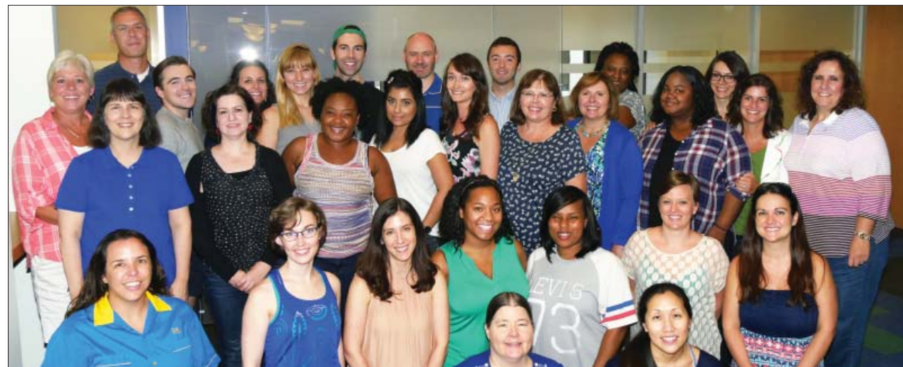
DANB and the DALE Foundation staff marked the end of the fiscal year with a fun summer celebration. (29 of 43 employees are pictured here.)