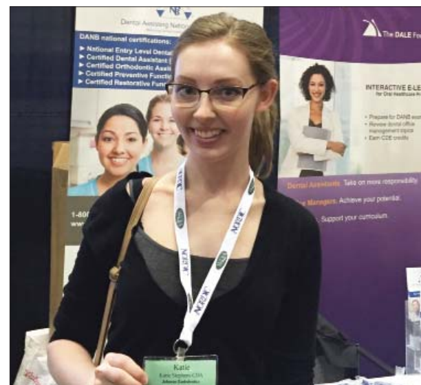
DANB certificant picks up exclusive gift at the Pacific Northwest Dental Conference.

To see where DANB and the DALE Foundation are exhibiting in 2017, visit www.danb.org and click on About DANB > News & Events > Meetings & Events. If you're attending one of the meetings, stop by our booth to pick up your exclusive DANB certificant gift and other giveaways!