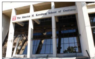
Maurice H. Kornberg School of Dentistry

completing the program, students who meet the admission requirements will be admitted to Temple University's Doctor of Dental Medicine program.