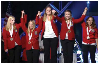
Dental Assisting Medal winners celebrate at the National SkillsUSA Championships

At the SkillsUSA Championships, top career and technical students from across the country come together to compete in their fields. After competing in regional competitions throughout this year, the top performing students traveled to Louisville, Kentucky, for the national championship in June. With nearly 100 competitive events and 6,000 competitors, the SkillsUSA Championships is a major event for these students, including those studying dental assisting, and presents unique opportunities for networking, confidence-building and growth.