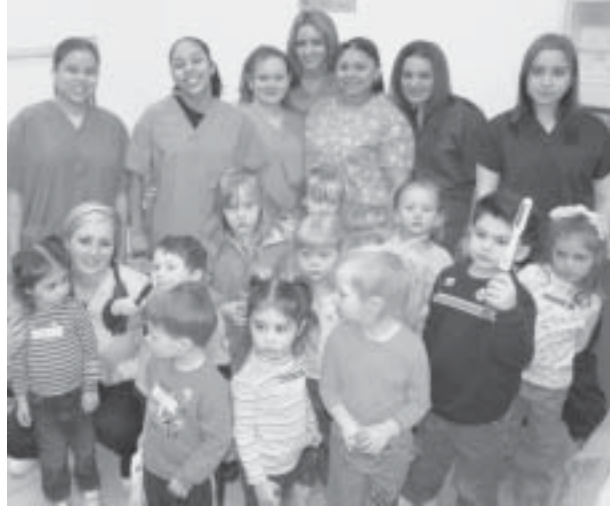
Dental assisting students celebrate DA Recognition Week

The students are enthused about their education and the profession they chose as a way to continue helping people.▲